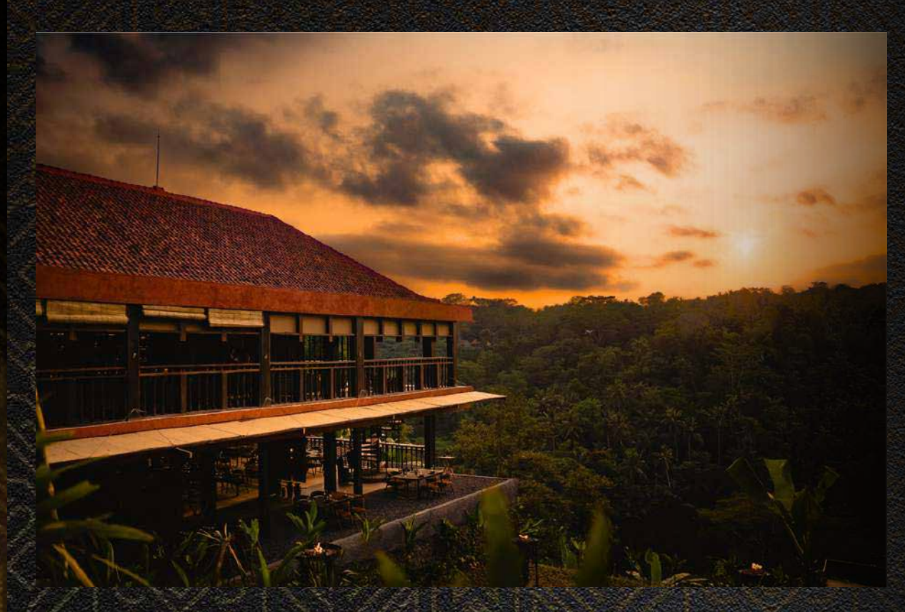
Arriba: The Latin American Bar