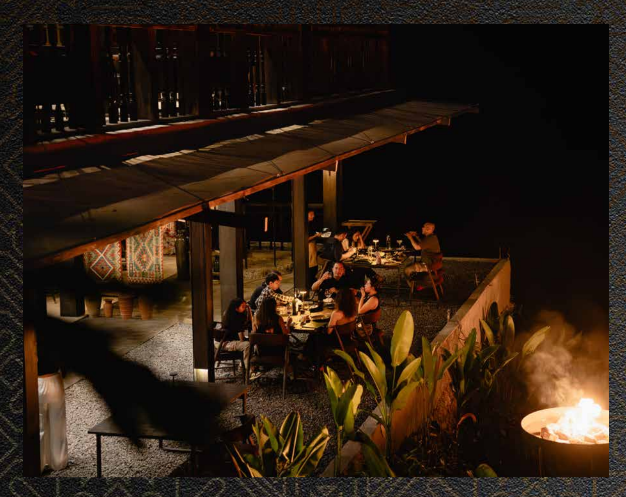
Chupacabras: Night Scenes

Adding a personalised touch, whenever guests order a steak, the chef arrives tableside with a meat tray, allowing guests to choose their cut and specify their preferred doneness. A salsa sommelier also accompanies the chef, presenting a curated selection of salsas to complement the steak, from chimichurri to huncaina, creating an interactive dining experience. For the wine enthusiasts, Chupacabras' sommelier will invite guests to the wine cellar for expert advice on the perfect wine pairings for their meal.